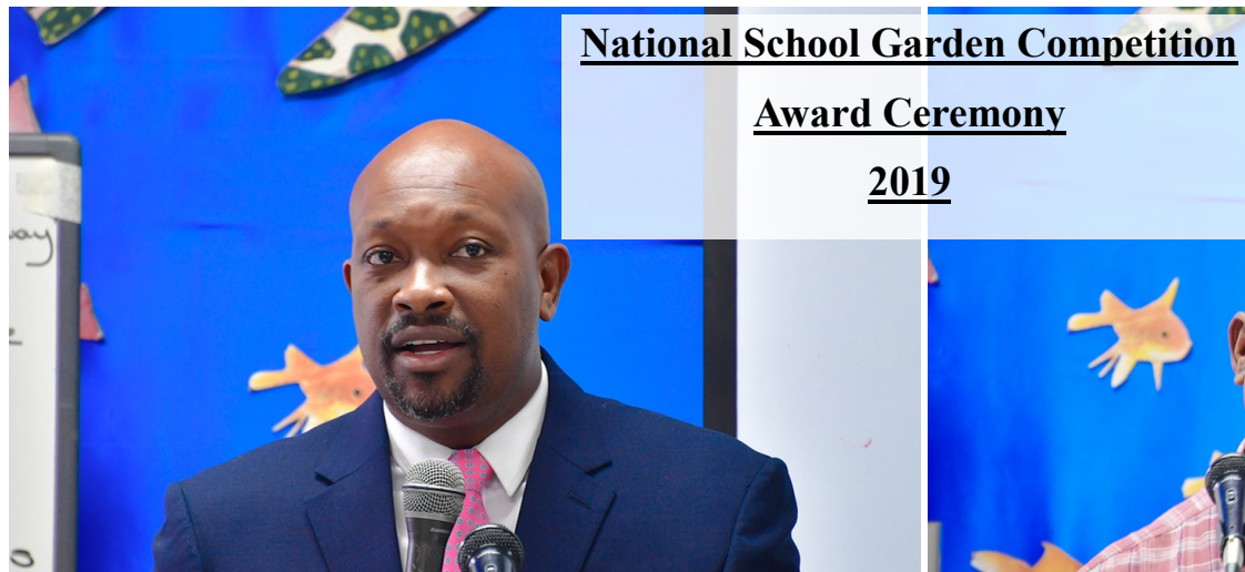
Minister of Agriculture, Forestry, Fisheries, Rural Transformation, Industry and Labour, Hon. Saboto Caesar delivering featured Address